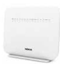
XGS PON Residential Gateway